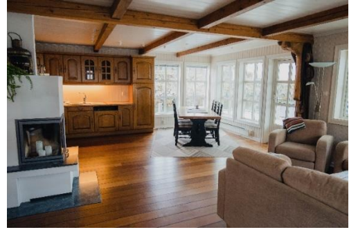
Rorbusuite XXL - 3 bedrooms (6 persons), 2 bathrooms

Rorbusuite XXL+ - 4 bedrooms (8 persons), 2 bathrooms and sauna