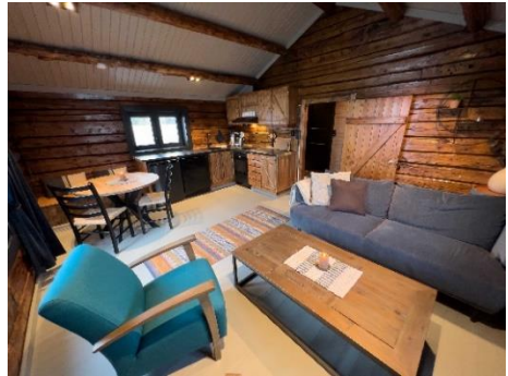
Rorbu S - TWIN - 1 bedroom with twin beds (2 people) and bathroom

Rorbu S - DOUBLE - 1 bedroom with double bed (2 people) and bathroom